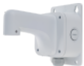
SN-CBK502 Wall Mount